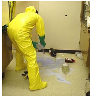
Haz Mat team member cleaning up a chemical spill.

UCSD's Hazardous Materials Response Team cleans up chemical, radioactive, and biological spills that are too large or too dangerous for general staff.